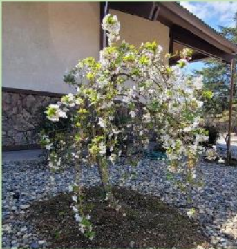
This is the snow fountain weeping cherry tree that was planted last summer replacing a decades'-old cherry tree. (North side of temple)