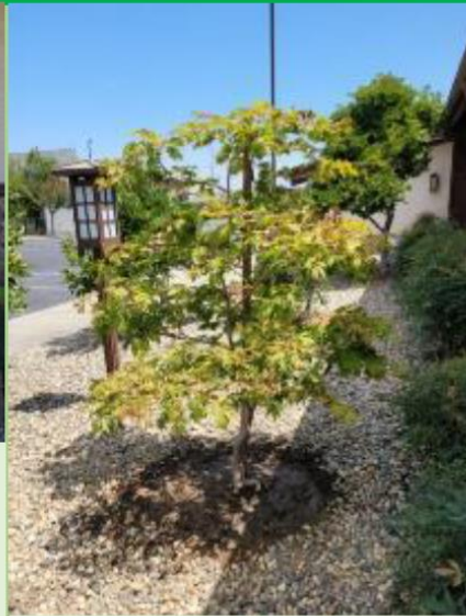
Summer (August), 2021