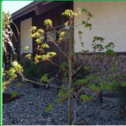
Spring, (April) 2020