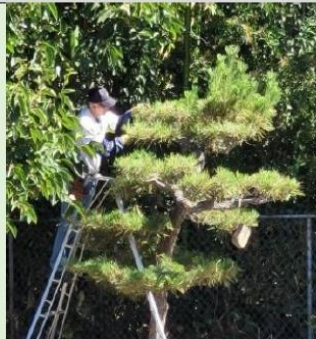
Ron Shimizu, pruning pine

Pruning, road debris pick up, BBQing as depicted in photos (on the right).