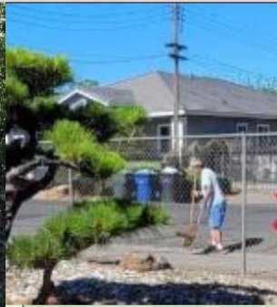
Ken Okabayashi, road PU