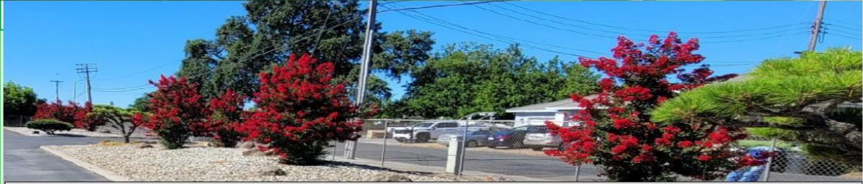
It's SUMMER!! Isle of Trees: Colorful crape myrtle trees in front of the church temple