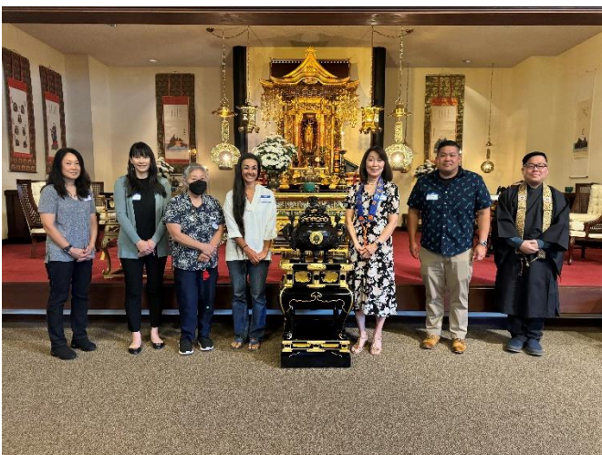
Dharma School Board