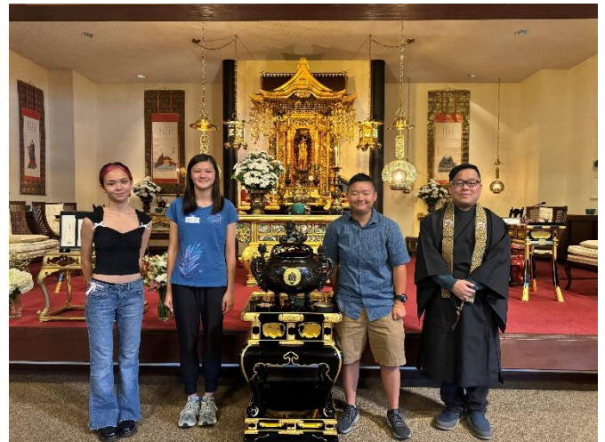
Jr. YBA Board