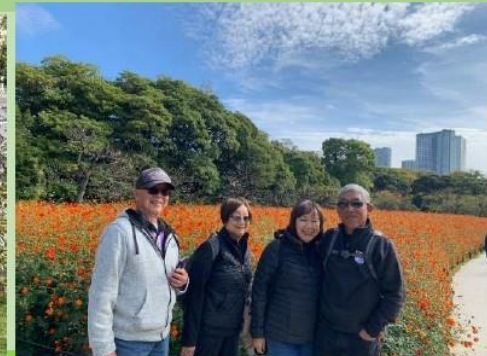
Hama-rikyu Garden, Tokyo